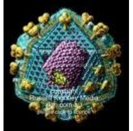
HIV Virus

In early November, SACEMA convened a group of TB and HIV experts to consider the unprecedented levels of both HIV and TB in various communities in the Western Cape. It is proposed to put together an intervention that will address these issues in at least two communities with differing prevalence of both diseases.